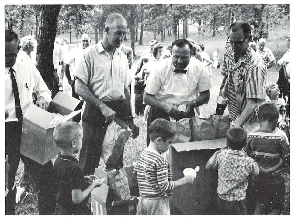
Young and old alike enjoy homemade ice cream.

skills, and in the final round Houston edged Corpus Christi for the championship. This was the second consecutive year of victory for Houston.