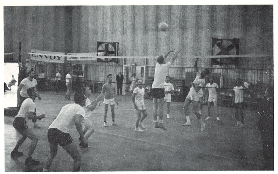
Houston on way to second consecutive championship!